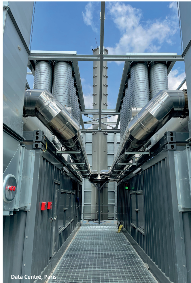
Data Centre, Paris

Our adaptability and attention to detail allow us to assist clients with particularly difficult or challenging projects, especially those involving specialist designers, contractors or products. Whether your project involves specialist medical equipment or particularly sensitive occupants, we should be able to provide technical and professional support to your scheme.