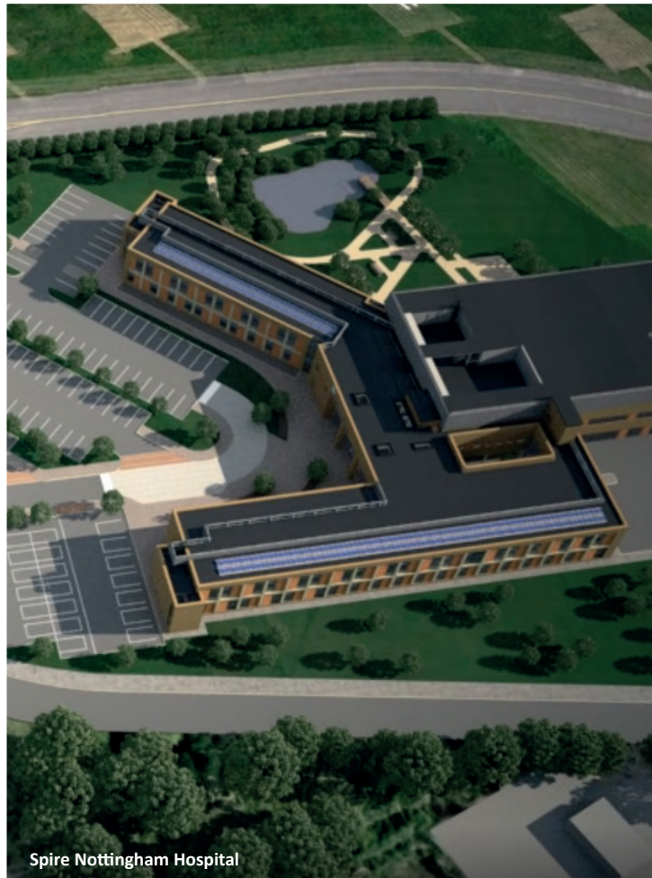
Spire Nottingham Hospital

Richard Herrmann Associates Ltd is an approachable and experienced structural and civil engineering consultancy based in Cambridgeshire, UK.